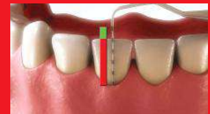
Expected results after TwinLight™